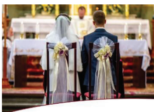
A Celebration of Marriage in the Archdiocese of Toronto

Marriage Sunday is celebrated to highlight the importance of the Sacrament of Matrimony and to affirm couples who strengthen our faith community through their witness. It also honours those who nurture marriage ministries - marriage preparation, enrichment, etc. Marriage Sunday was first