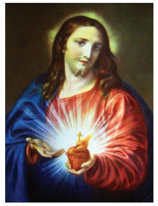
Sacred Heart of Jesus by Pompeo Batoni, 1767, Church of the Gesu, Rome