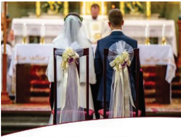
A Celebration of Marriage in the Archdiocese of Toronto