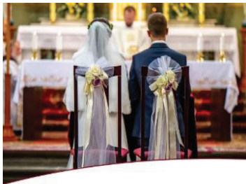
A Celebration of Marriage in the Archdiocese of Toronto