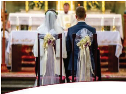
A Celebration of Marriage in the Archdiocese of Toronto