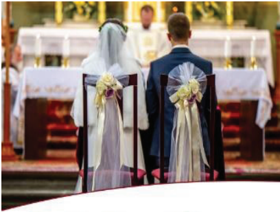
A Celebration of Marriage in the Archdiocese of Toronto