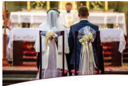
A Celebration of Marriage in the Archdiocese of Toronto