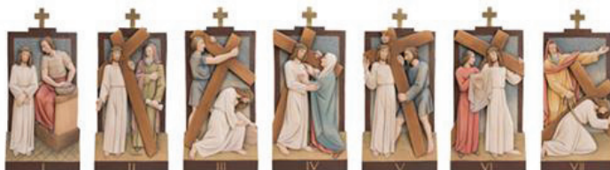
STATIONS OF THE CROSS ST. MARGARET'S & ST. EUGENE'S ALL FRIDAYS AFTER 7:00PM MASS