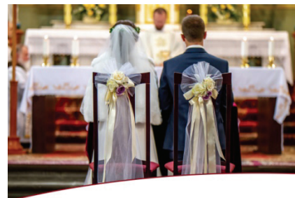
A Celebration of Marriage in the Archdiocese of Toronto